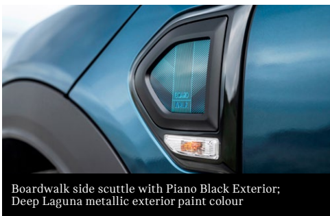
Boardwalk side scuttle with Piano Black Exterior; Deep Laguna metallic exterior paint colour

The Boardwalk Edition comes with the fixed specification listed here, with the choice between different engine variants (Cooper or Cooper S) and transmission types (manual or automatic). A few features will vary depending on the variant chosen. The edition is based on the Exclusive style and includes equipment that would normally be optional; some features that normally come as standard with the Exclusive style have also been removed for this edition (Chrome Line Interior and MINI Yours interior style).