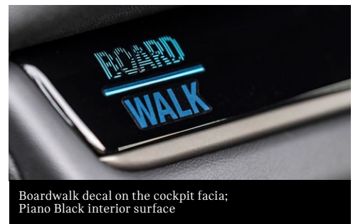
Boardwalk decal on the cockpit fascia; Piano Black interior surface